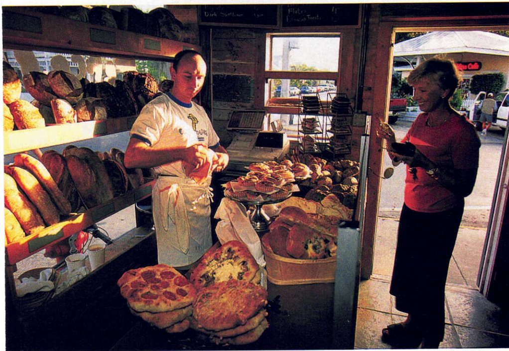
Their daily bread: Key West locals buy it fresh and flavorful at Cole’s Peace bakery.

Although a short journey away, lower Petronia is culturally as far from whole grain bread as it’s possible to get. There in the heart of Bahama Village, porch sitting is a pastime, and people always stop to say hello. If someone leans into a friend’s car window to chat, other cars wait without a toot – or they take the